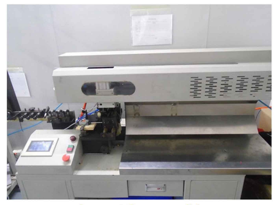
wire cutting machine