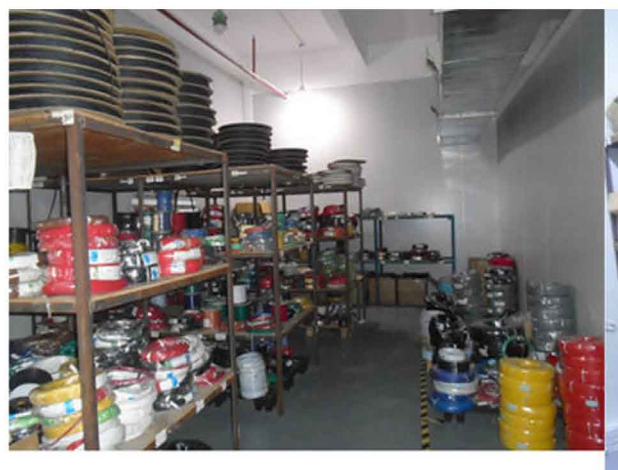
material ware house