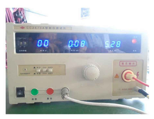
voltage resistence test machine